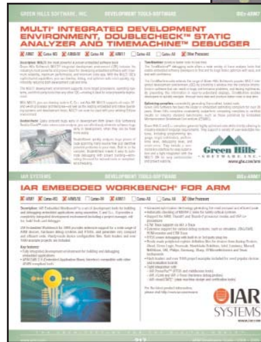
Shown above: Full page data sheet (left), and 1/2 page data sheets (right).

We will take your approved, on-line ARM Connected Community entry and format them for publication.